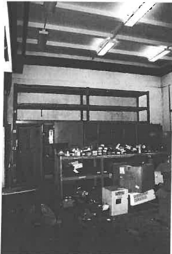
Solar Array Test Building (60540), Interior View