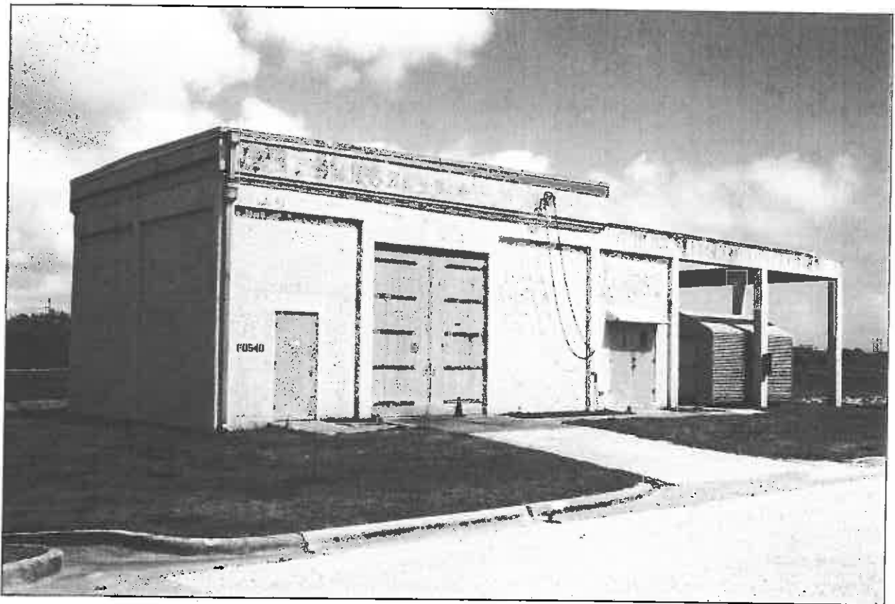
Solar Array Test Building (60540), View Northwest