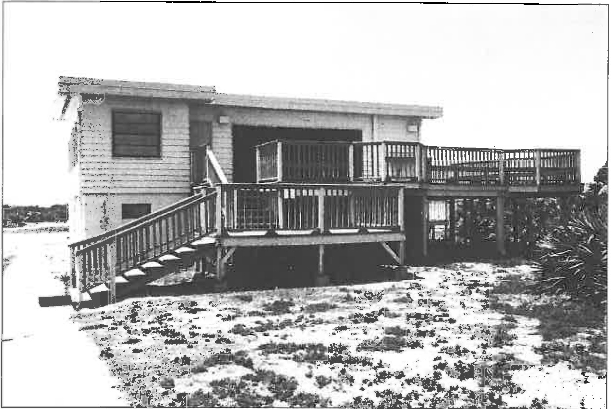
Beach House (K8-1699) Exterior View of the East (Front) Elevation, View West