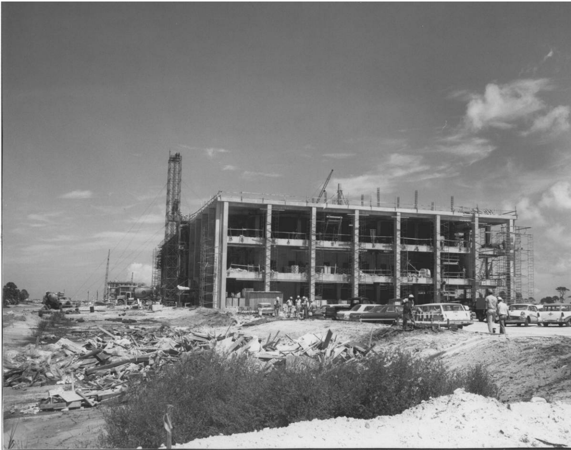
Figure A-2. Construction of the CIF, July 29, 1964.