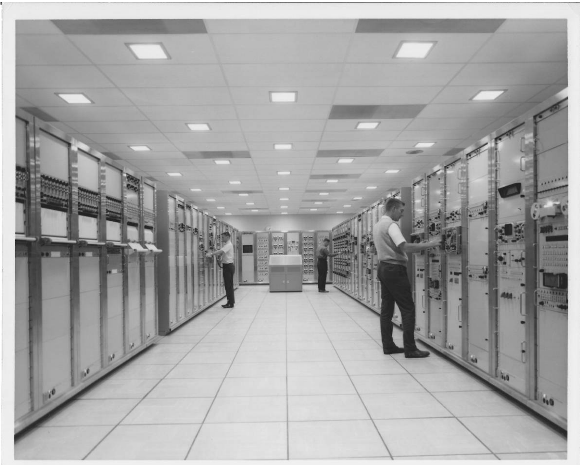
Figure A-7. Telemetry station within the CIF, Room No. 291, November 1, 1965.