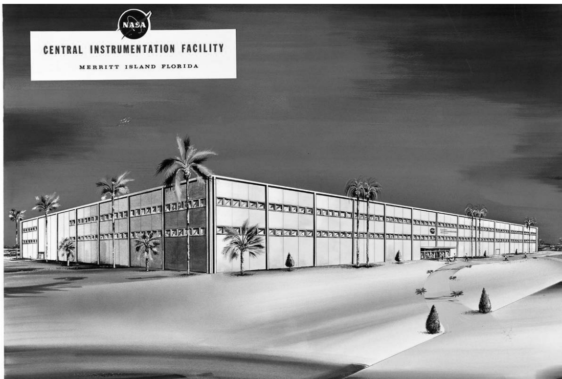
Figure A-1. Artist's Concept of the CIF, September 6, 1963.