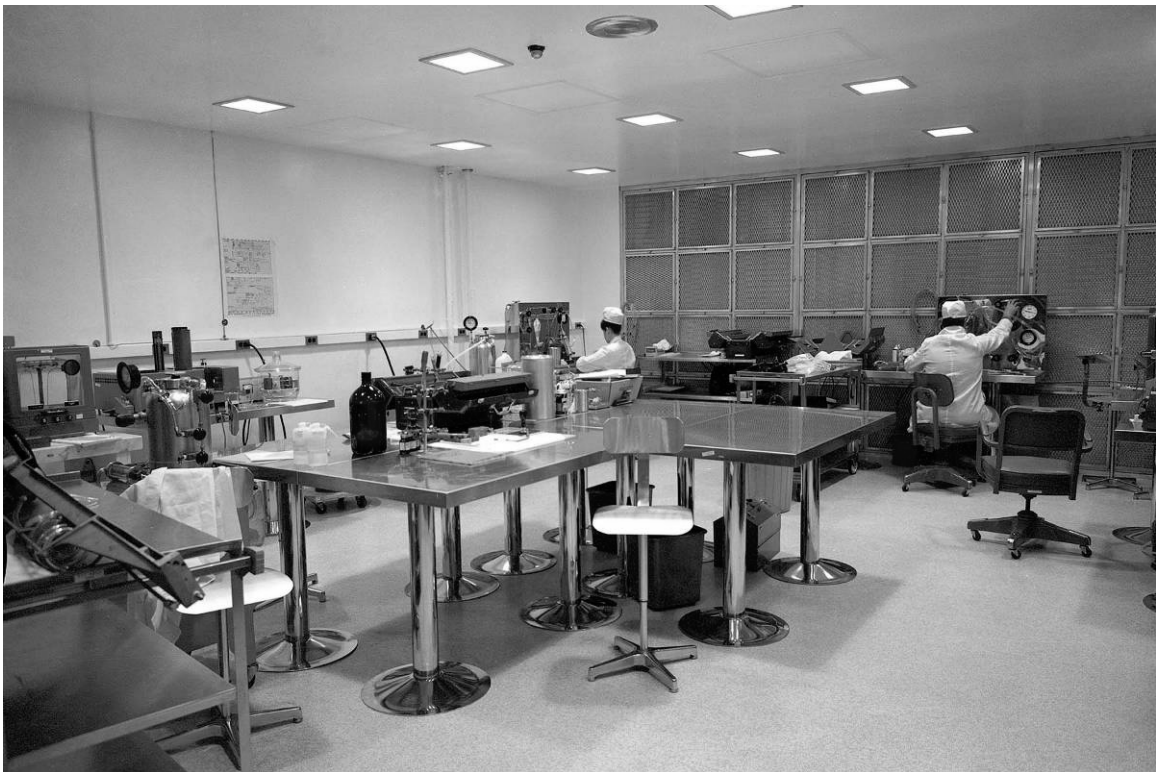
Figure A-12. View of Room No. 112, Instrument Cleaning/Inspection Lab, 1967.