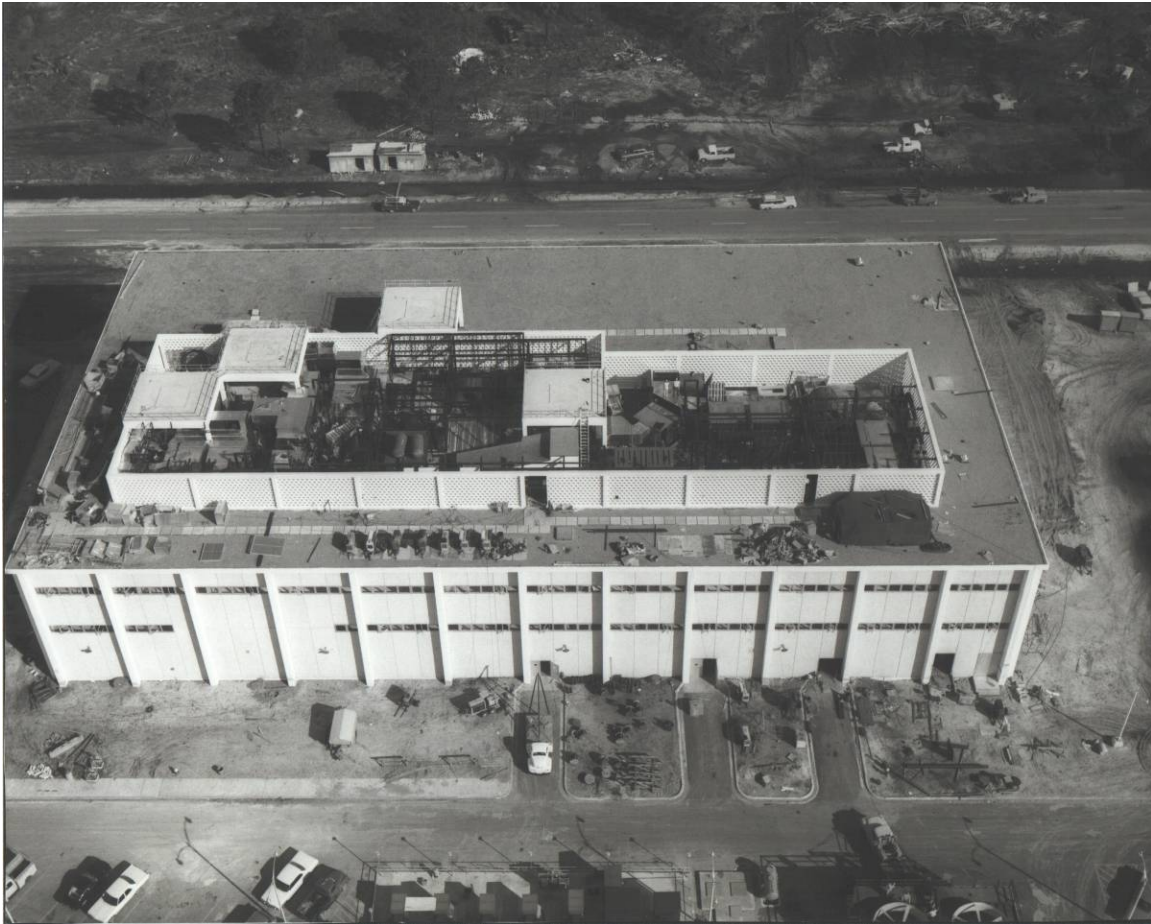
Figure A-4. Construction on roof of the CIF for electronics and tracking components, February 11, 1965.

Source: John F. Kennedy Space Center Archives, 100-KSC-65-2846.