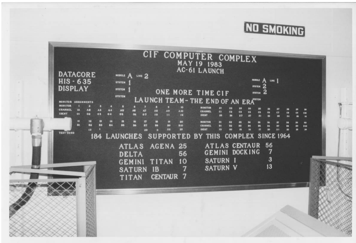
Figure A-14. View of sign within the CIF, no date.