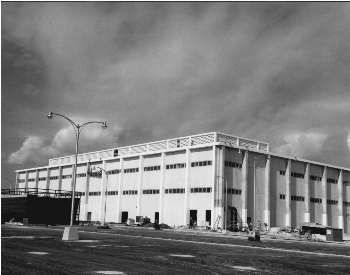
Figure A-3. Construction of the CIF, January 8, 1965.