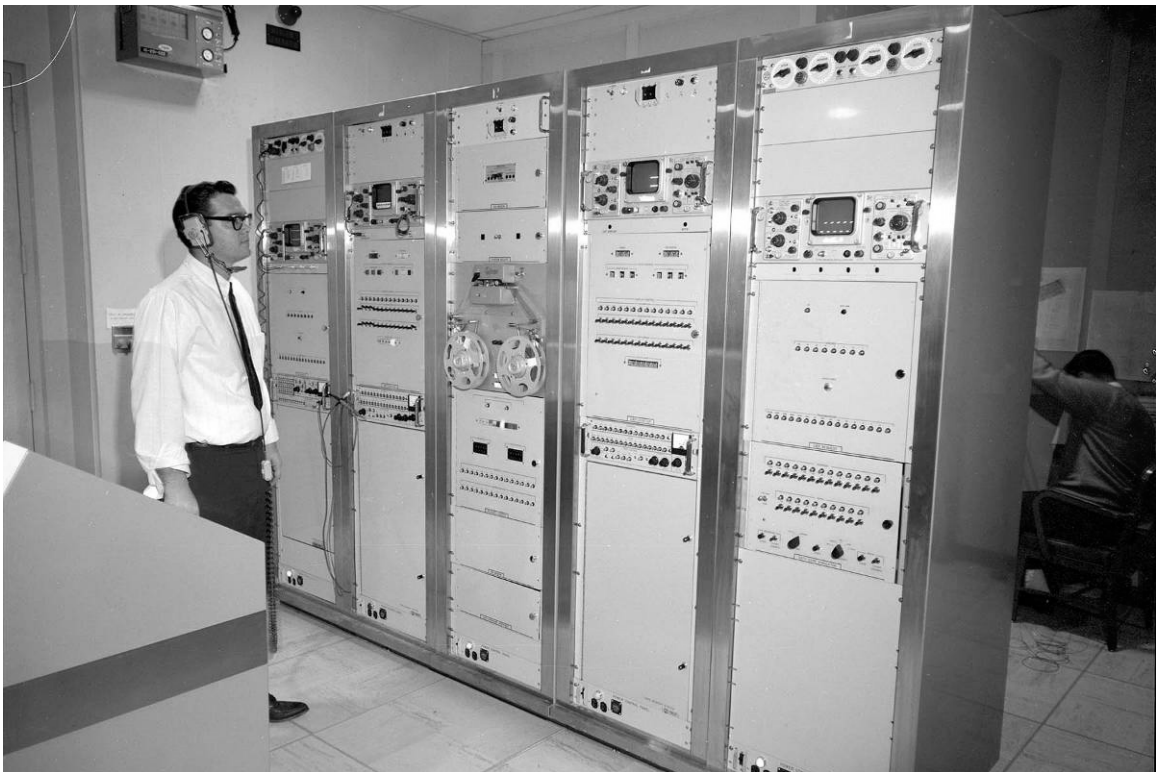
Figure A-13. View of the CIF computer complex, Room No. 205, 1967.