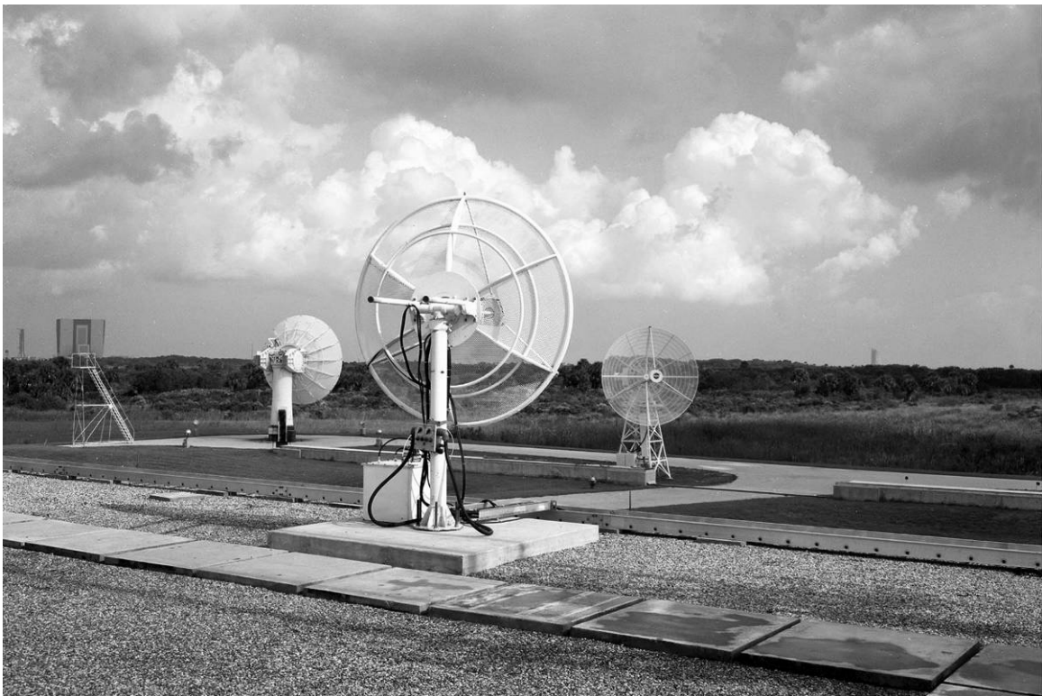
Figure A-6. View of radar dishes on the roof of the CIF, October 27, 1967.