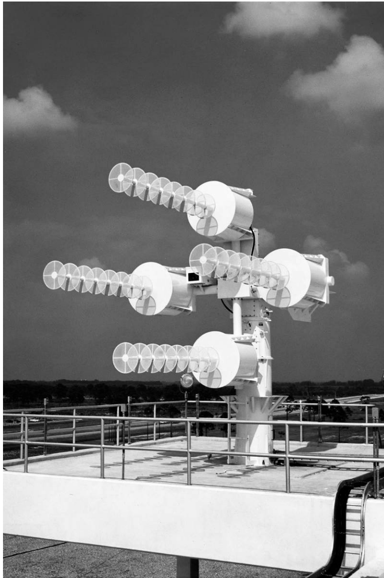
Figure A-5. Telemetry antenna on the roof of the CIF, October 5, 1966.