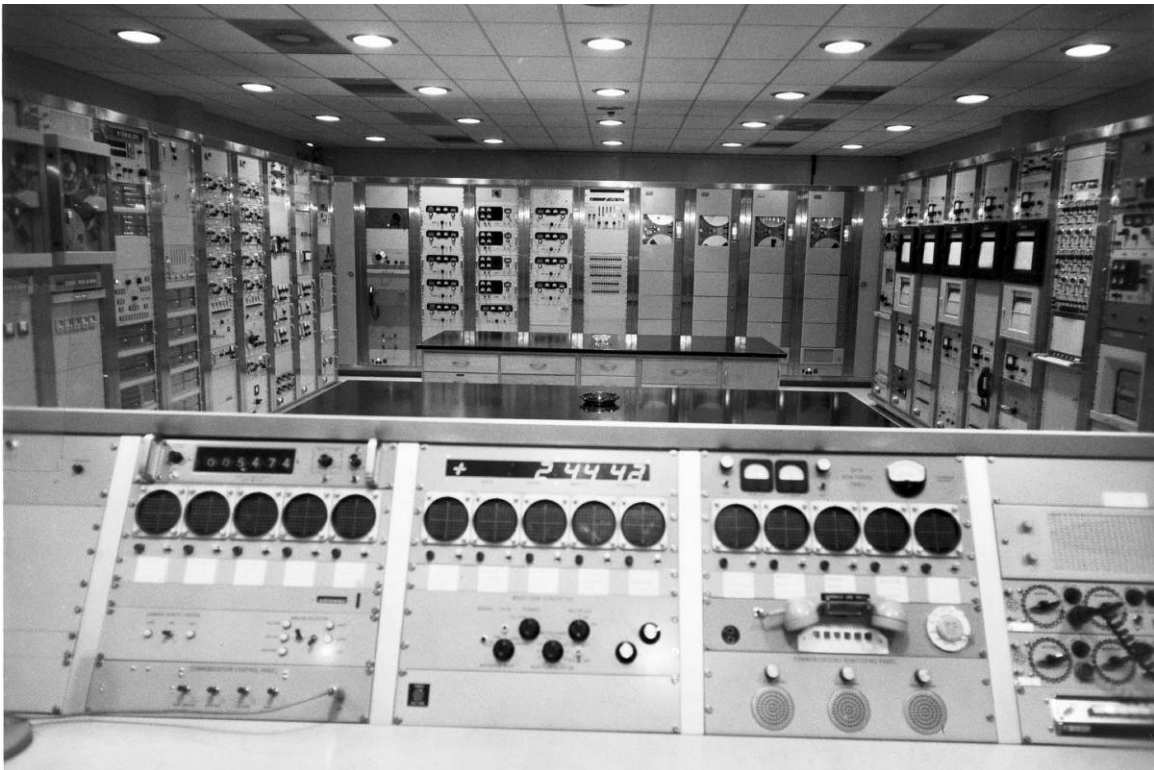
Figure A-10. View of a control room within the CIF, October 5, 1966.