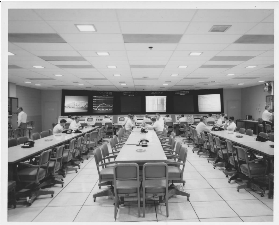
Figure A-9. View of the Data Presentation and Evaluation Room, Room No. 307, September 27, 1967.