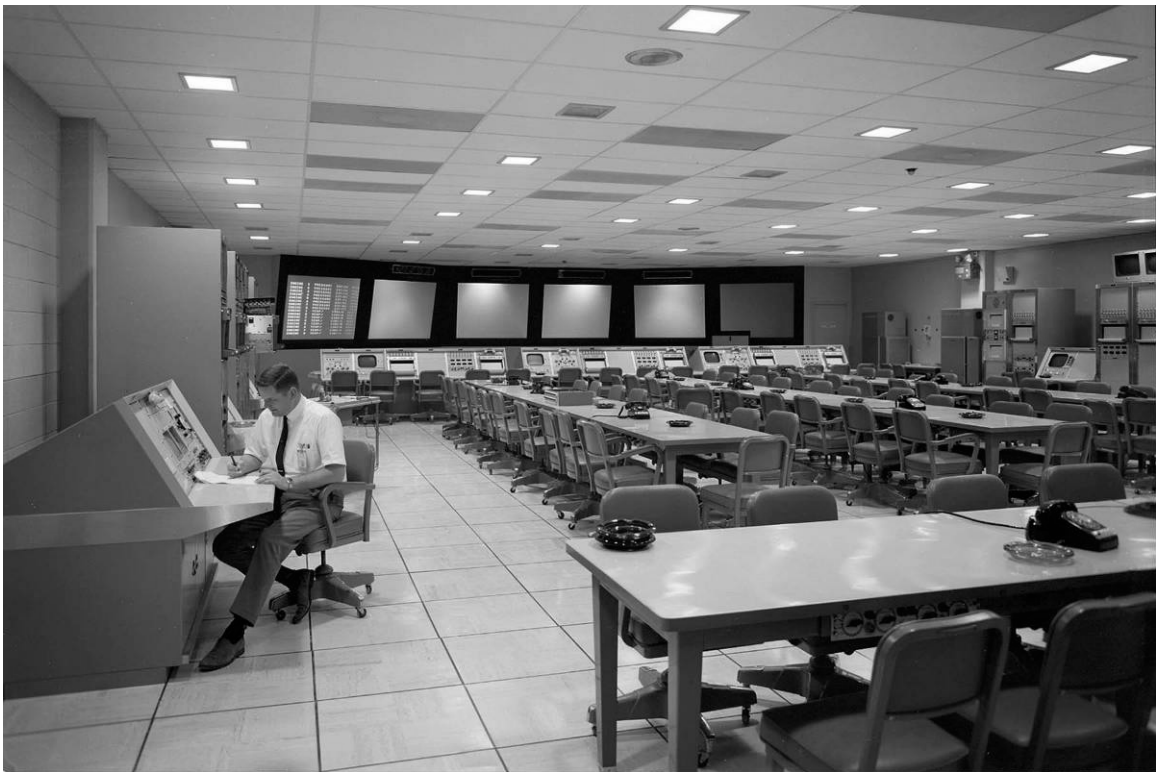
Figure A-8. View of the Data Presentation and Evaluation Room, Room No. 307, 1967.