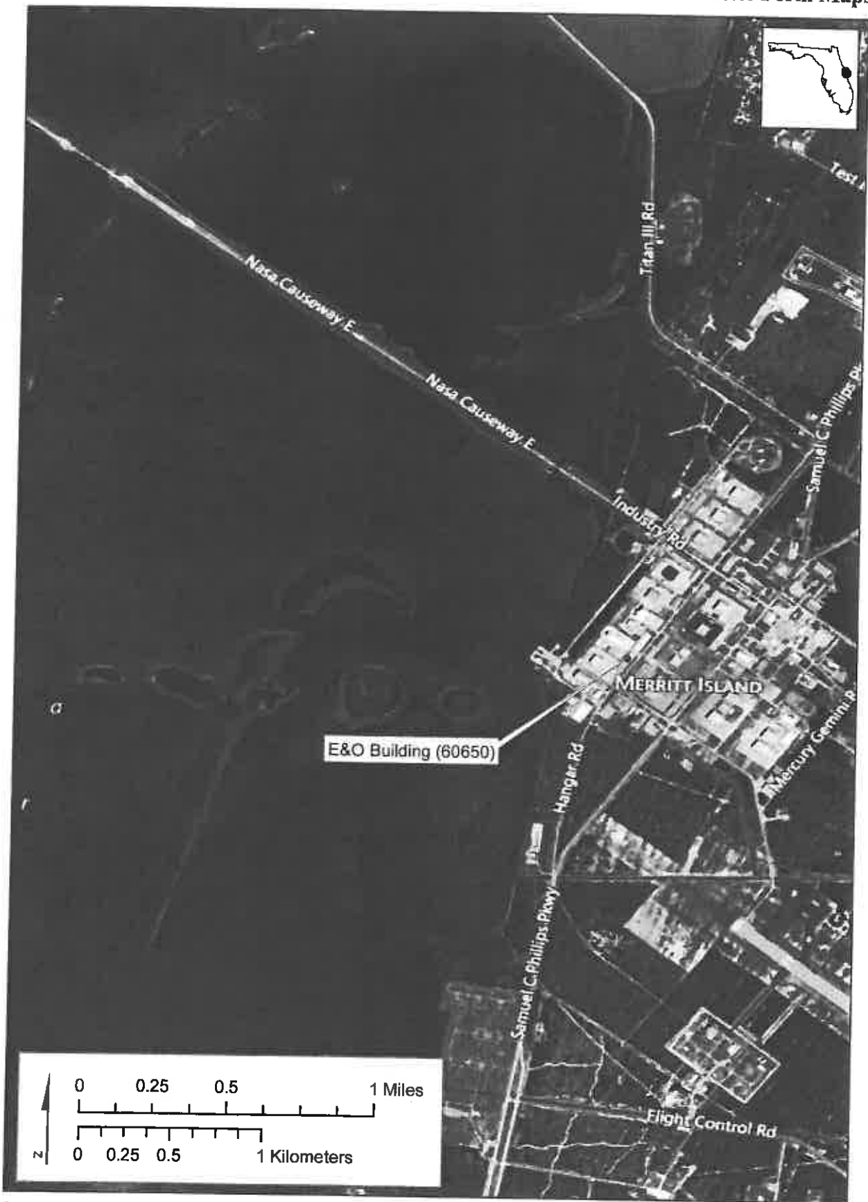
Orsino, Florida Quadrangle