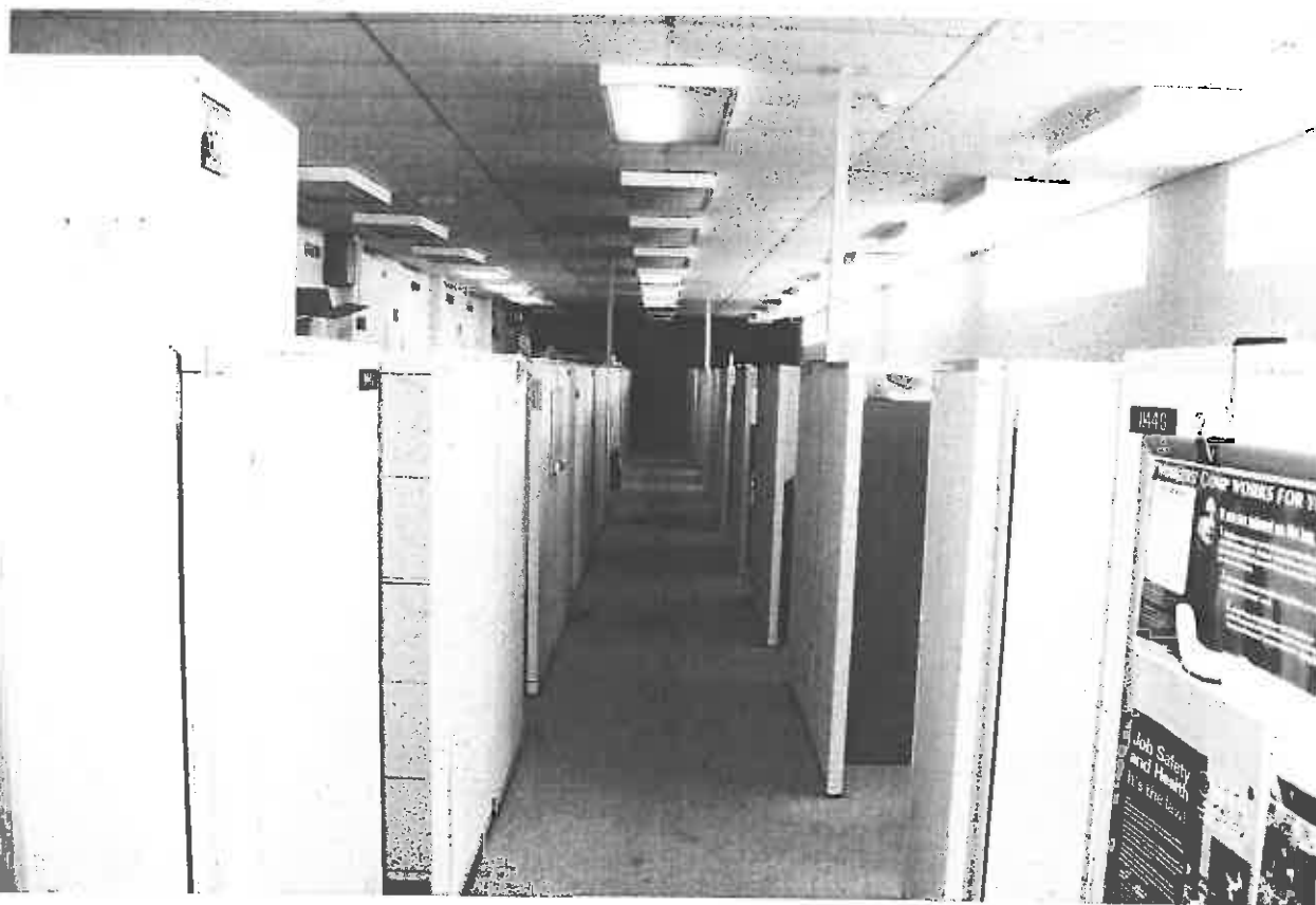
E&O Building (60650), Interior View