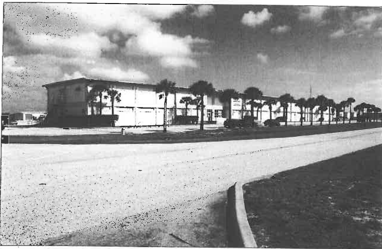
E&O Building (60650), View Northwest