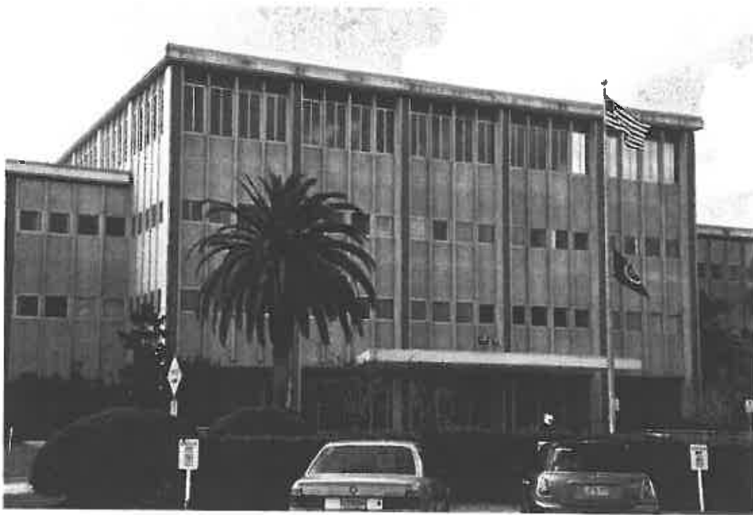
Main entrance area, facing southwest