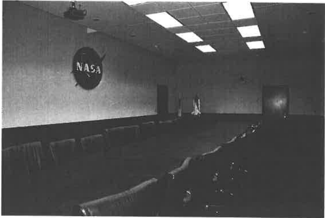
Fourth Floor conference room, facing northeast