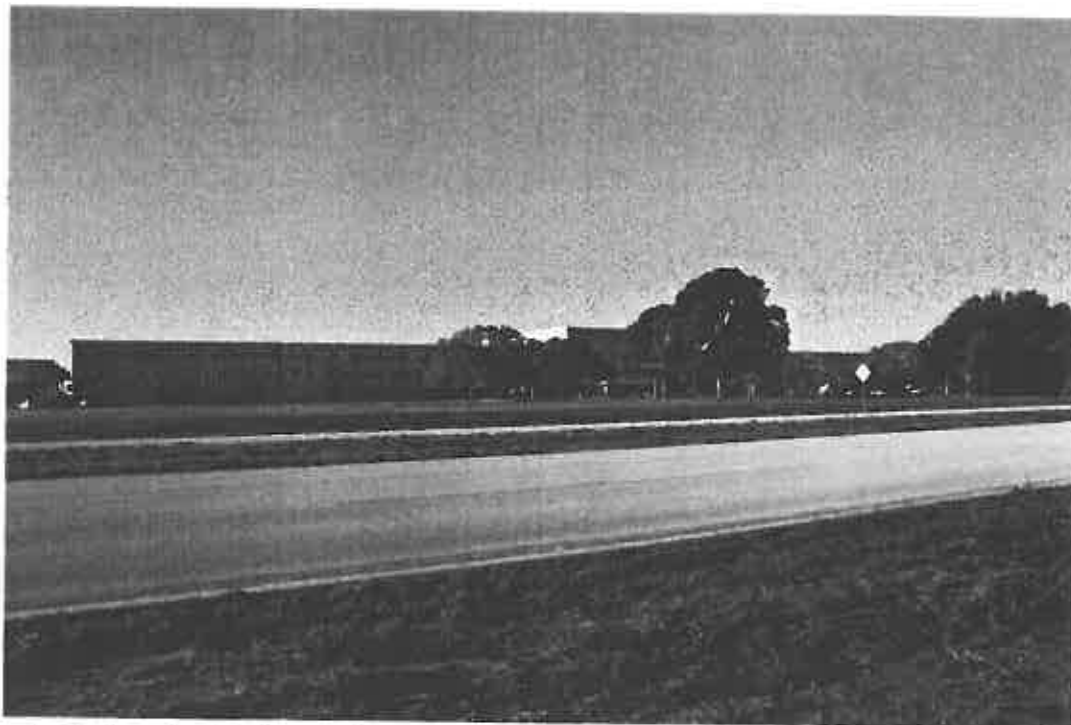
North elevation, facing southwest