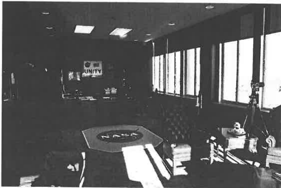
Center Director's office, facing northwest