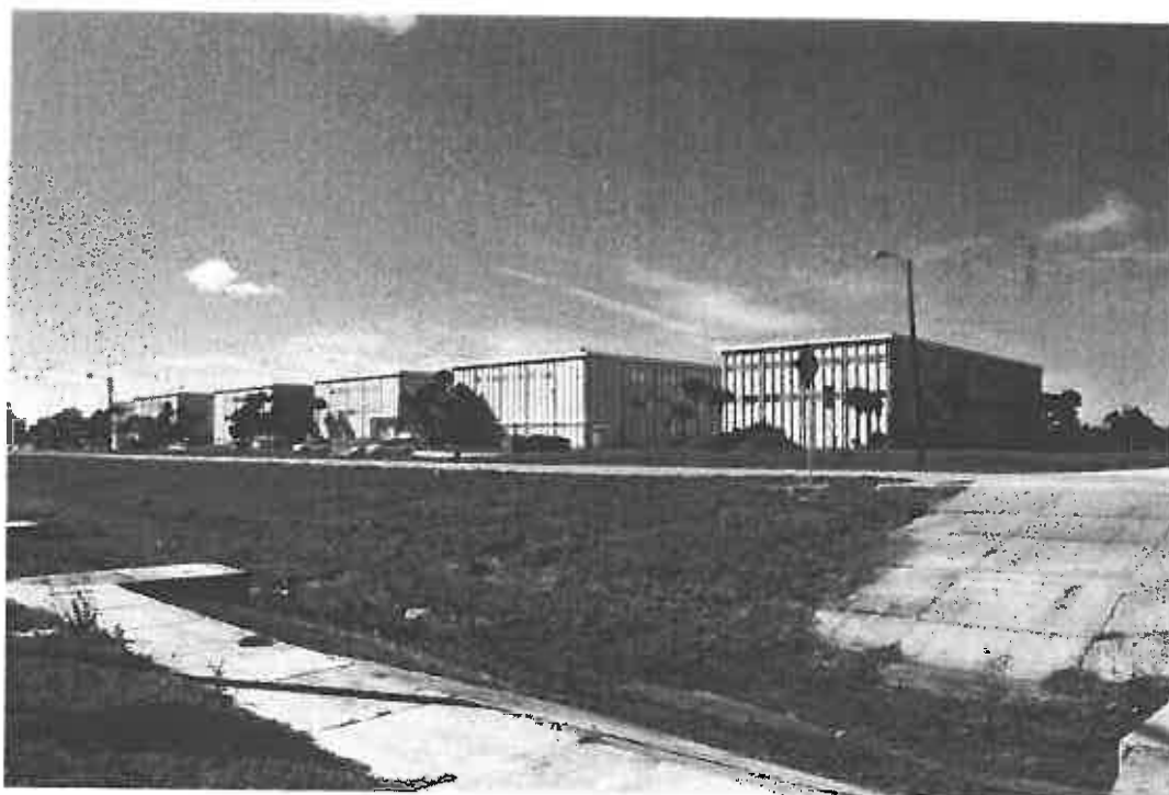
South and east elevations, facing northwest