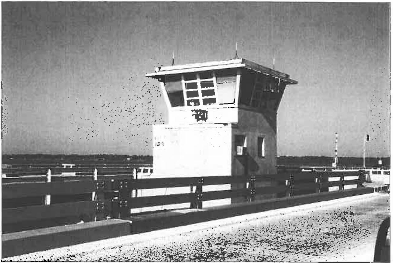
Indian River Bridge (M3-0003) Control House, View Southwest