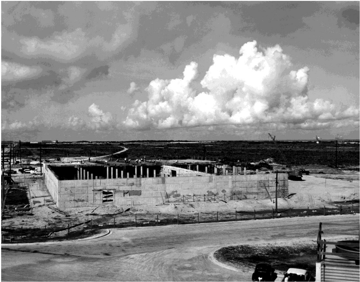
Photo A-1. Operations Support Building, Complex 34, CCMTA, July 5, 1961.