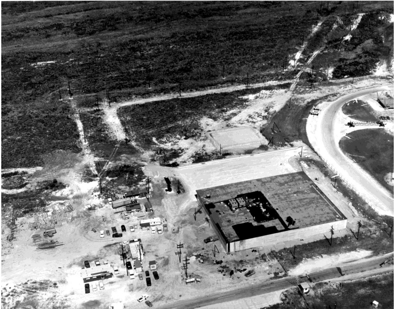
Photo A-3. Aerial view, operation support, Pad 34, CCMTA, September 15, 1961.